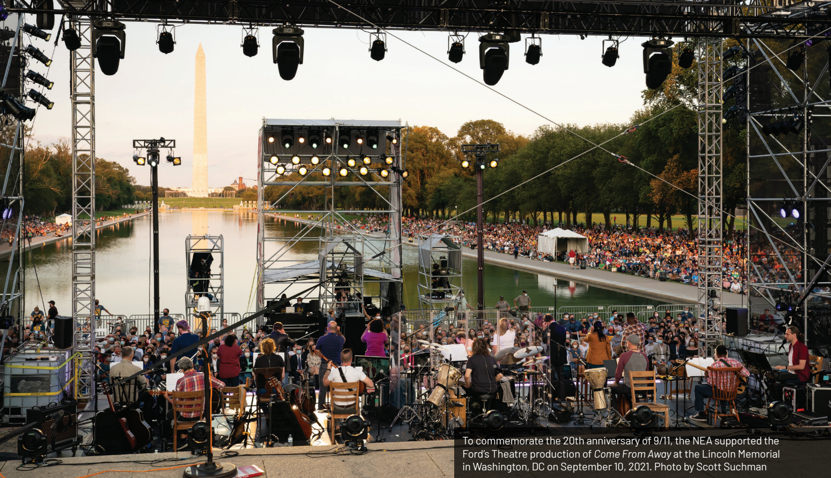
To commemorate the 20th anniversary of 9/11, the NEA supported the Ford's Theatre production of Come From Away at the Lincoln Memorial in Washington, DC on September 10, 2021.