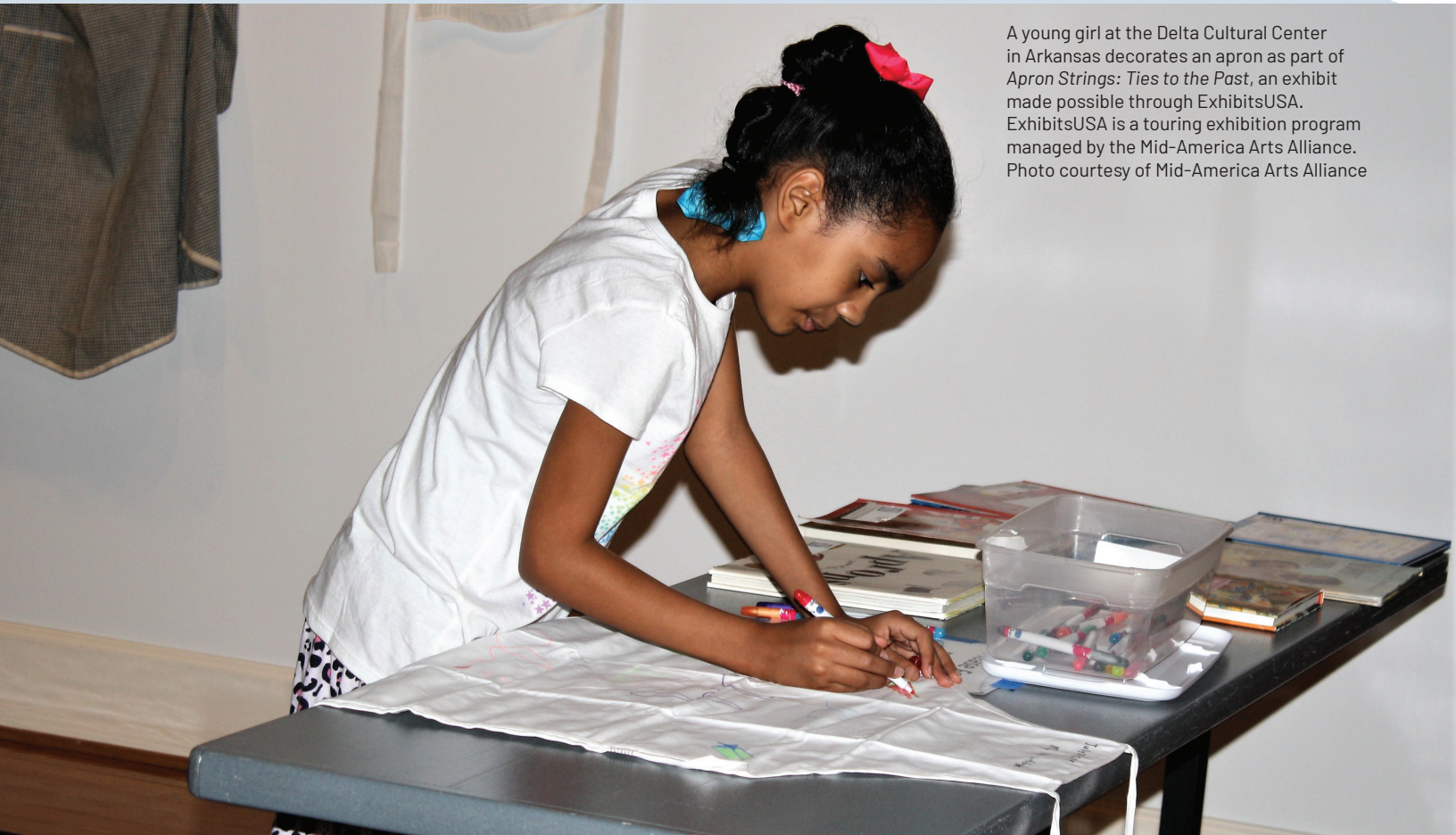
A young girl at the Delta Cultural Center in Arkansas decorates an apron as part of Apron Strings: Ties to the Past, an exhibit made possible through ExhibitsUSA. ExhibitsUSA is a touring exhibition program managed by the Mid-America Arts Alliance.