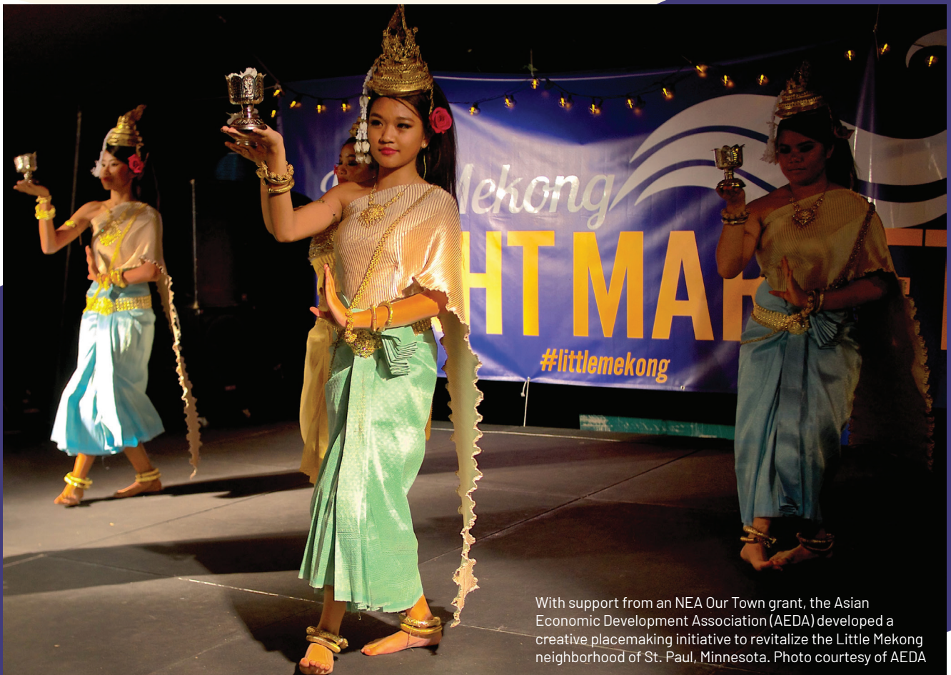
With support from an NEA Our Town grant, the Asian Economic Development Association (AEDA) developed a creative placemaking initiative to revitalize the Little Mekong neighborhood of St. Paul, Minnesota.