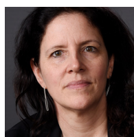
Laura Poitras My Country, My Country