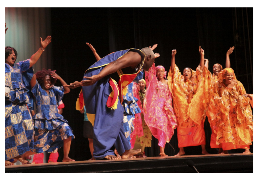
The action of the "bantaba" and Finale of the 2010 Florida African Dance Festival concert performance.