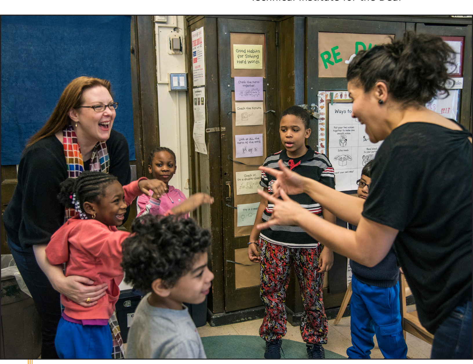
Our Voices Three-Day Generative Storytelling Workshop with students from PS 347, the American Sign Language and English Lower School in New York City.