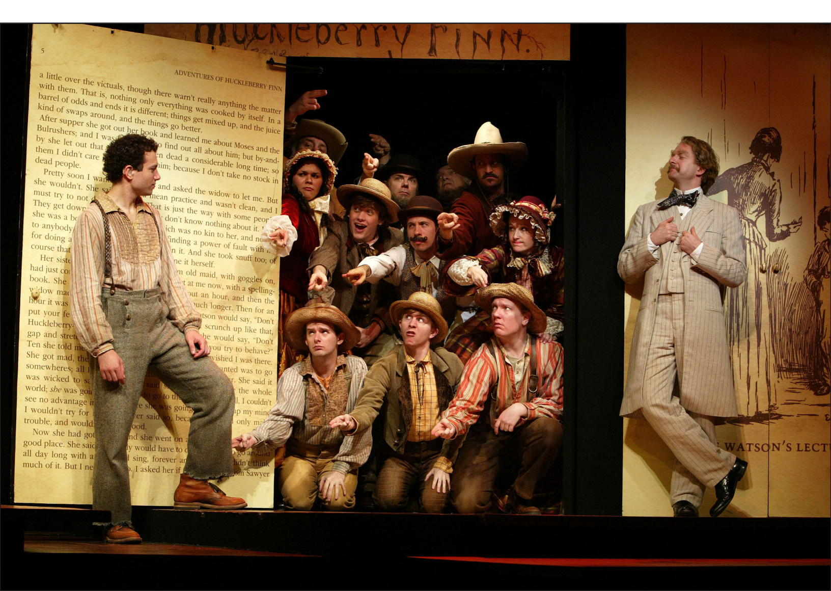
The Roundabout Theatre Company/Deaf West Theatre production of Big River.