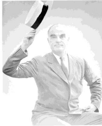
Thornton Wilder in the role of George Antrobus in The Skin of Our Teeth

Education was one of Wilder's deepest passions. During his time at Lawrenceville, he earned a master's in French