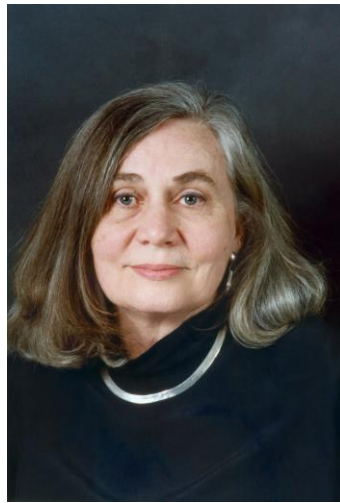
Marilynne Robinson

As one might imagine from reading her work, Marilynne Robinson is passionately tied to the dramatic northwest landscape of her childhood. She was born in Sandpoint, Idaho, where her family had lived for four generations: her grandparents were farmers and ranchers; her father was in the lumber industry. Robinson recalls hearing the whistles of passing trains, though "nothing ever seemed to stop" at the railroad junction in town.