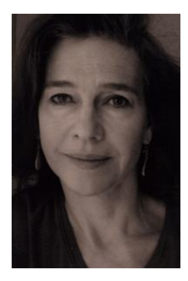
Louise Erdrich

Erdrich was raised in a literature-rich environment; her father often recited the