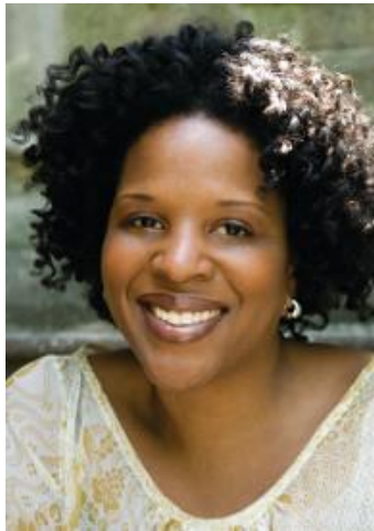
Tayari Jones, 2010

Tayari Jones was born and raised in Atlanta, Georgia where (with the exception of one year in Nigeria) she spent most of her childhood. Even though she has not lived in her hometown for more than a decade, most of her writing centers on the urban South. "Although I now live in the Northeast," she explains, "my imagination lives in Atlanta."