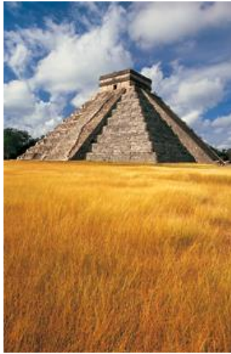
Temple of El Castillo in Chichen Itza, Yucatan, Mexico

Juan Rulfo is considered one of Mexico's greatest writers despite having published only two books: the influential short-story collection The Burning Plain (1953), and the immensely celebrated novel Pedro Páramo (1955). In 1970, Rulfo received Mexico's National Prize for Literature and, in 1983, the prestigious Prince of Asturias Award in Spain. Born in the western state of Jalisco in the town of Sayula, Rulfo grew up to capture in words the atmosphere and landscape of his roots.