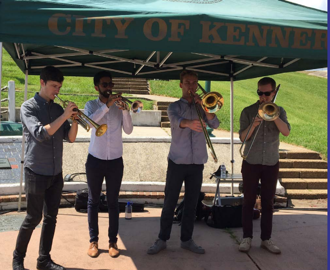
Top and bottom left: Students in Opelousas painted banners inspired by the music WindSync brought to school. Bottom right: The Westerlies perform at the farmers market, testing out its new location on LaSalle's Landing.