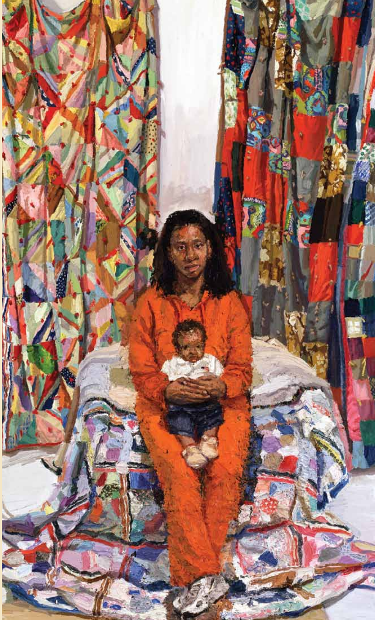
Letitia and The Rising Sun, 2006, by Sedrick Huckaby.