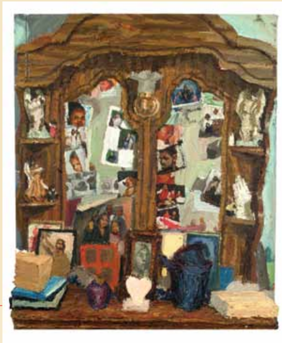
The Altar Dresser, 2008, by Sedrick Huckaby.

NEA: Do you feel like you have to sacrifice ambitions of becoming a “major artist” in order to raise a family, or can they go hand-in-hand?