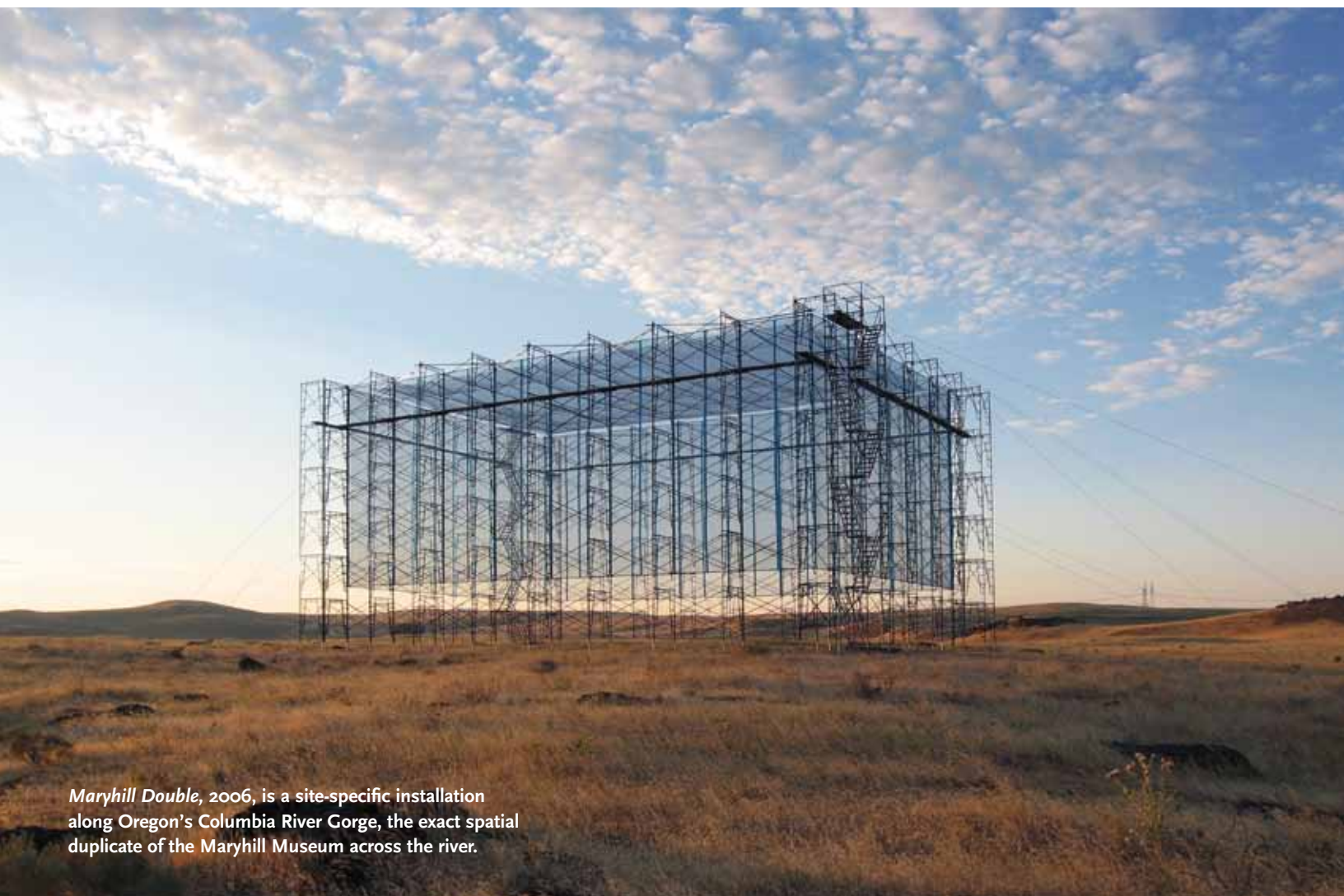
Maryhill Double, 2006, is a site-specific installation along Oregon’s Columbia River Gorge, the exact spatial duplicate of the Maryhill Museum across the river.