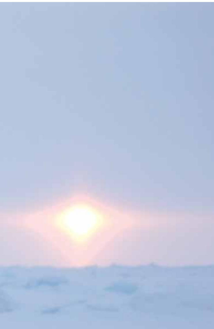
A still from MacLean's short film Sikumi (2008).