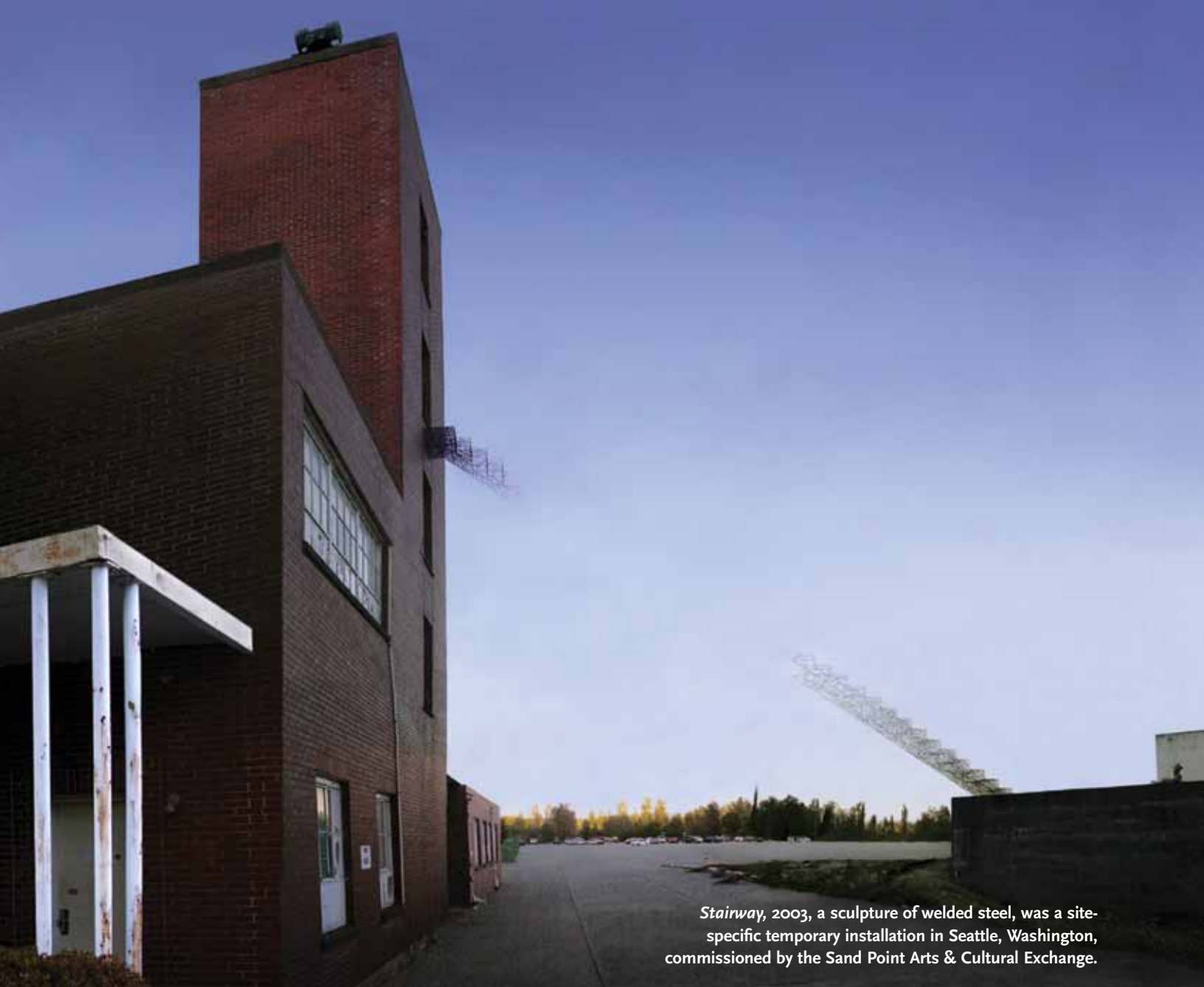
Stairway , 2003, a sculpture of welded steel, was a site-specific temporary installation in Seattle, Washington, commissioned by the Sand Point Arts & Cultural Exchange.

in the arts and in architecture, so architecture students were encouraged to take their electives in art and vice-versa.”