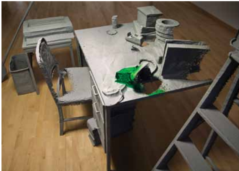
A detail from Surface Deposit , 2010, a site-specific installation for Temple Gallery at Tyler School of Art in Philadelphia, Pennsylvania.

It was in the University of Oregon's School of